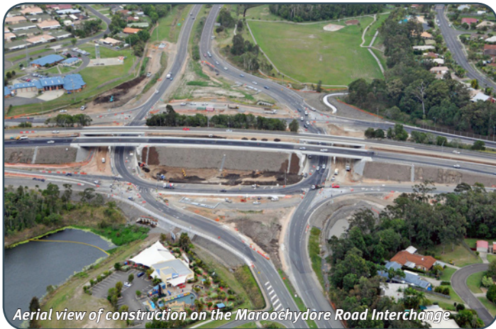
Aerial view of construction on the Maroochydore Road Interchange