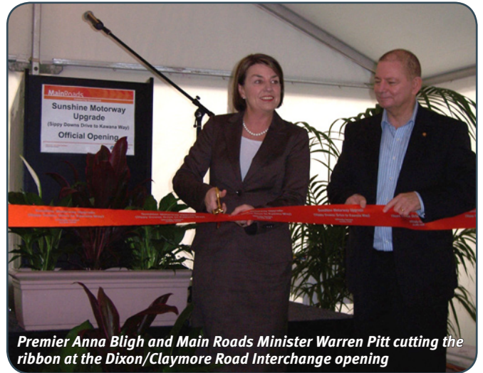
Premier Anna Bligh and Main Roads Minister Warren Pitt cutting the ribbon at the Dixon/Claymore Road Interchange opening