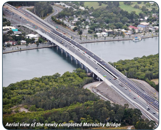
Aerial view of the newly completed Maroochy Bridge